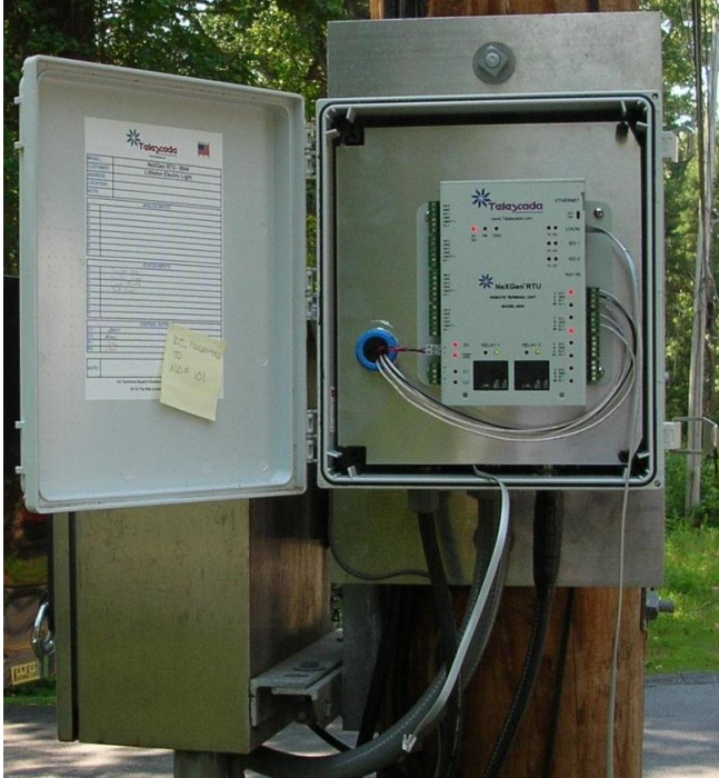
The NeXGen™ RTU-8844 Controlling an S&C Scada-Mate® Group Operated Switch

The Telescada NeXGen™ RTU-8844 Remote Terminal Unit is a powerful, flexible and economical solution for sectionalizing motor operated switch automation, monitoring, alarming, recording and control.